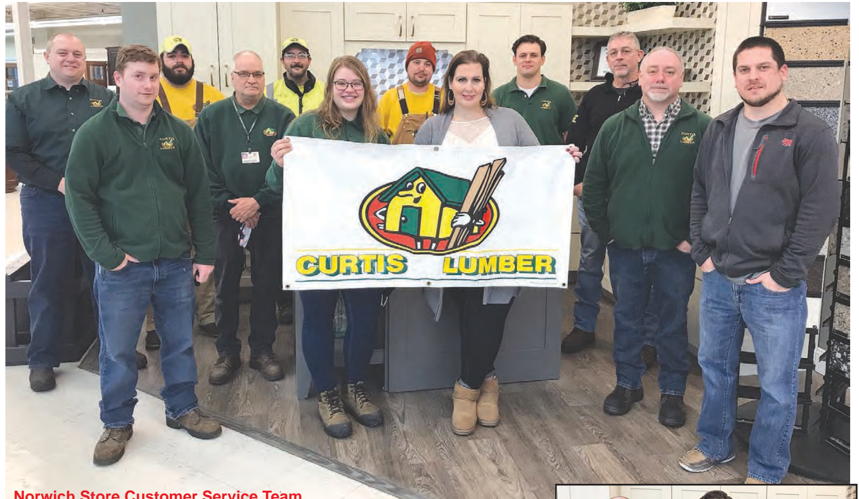
Norwich Store Customer Service Team