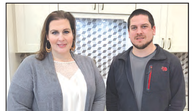
Kitchen & Bath Specialists