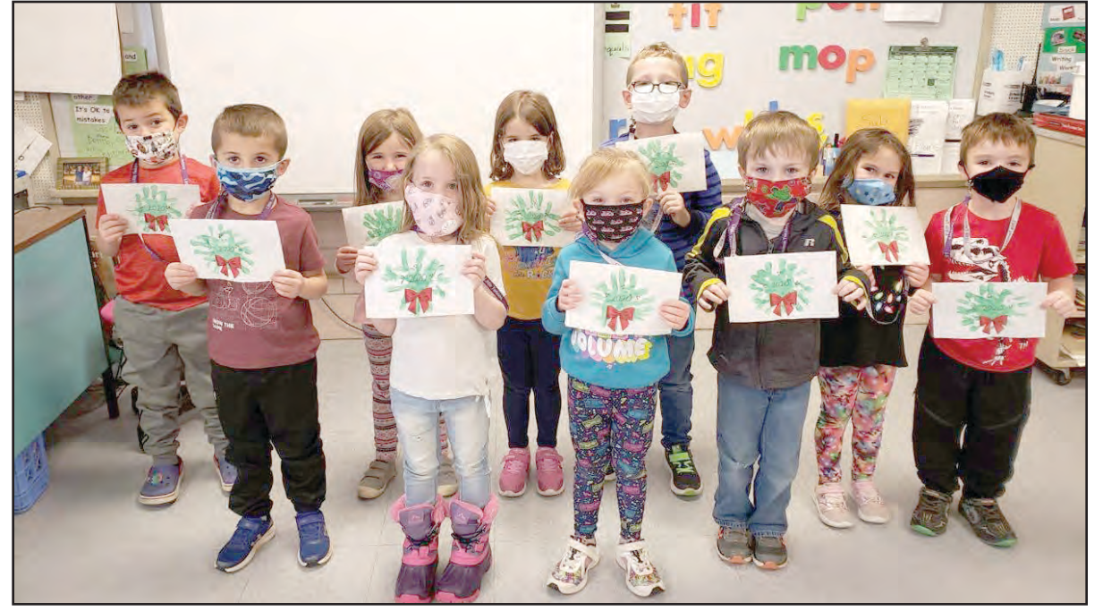
Gibson students volunteered to spread some Christmas cheer by making holiday cards that were distributed with Helping Hands bags handed out in December.

For the time being, big developments at NCSD are being characterized by pandemic response, and many of the district's marching orders are coming from the Department of Health.