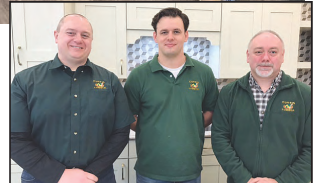
Contractor Sales & Service