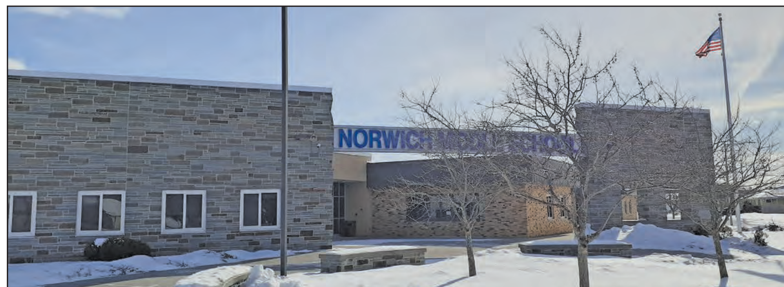
The district is in a constant state of reaction, spurred by COVID-19 positivity rates in its schools and the surrounding community.