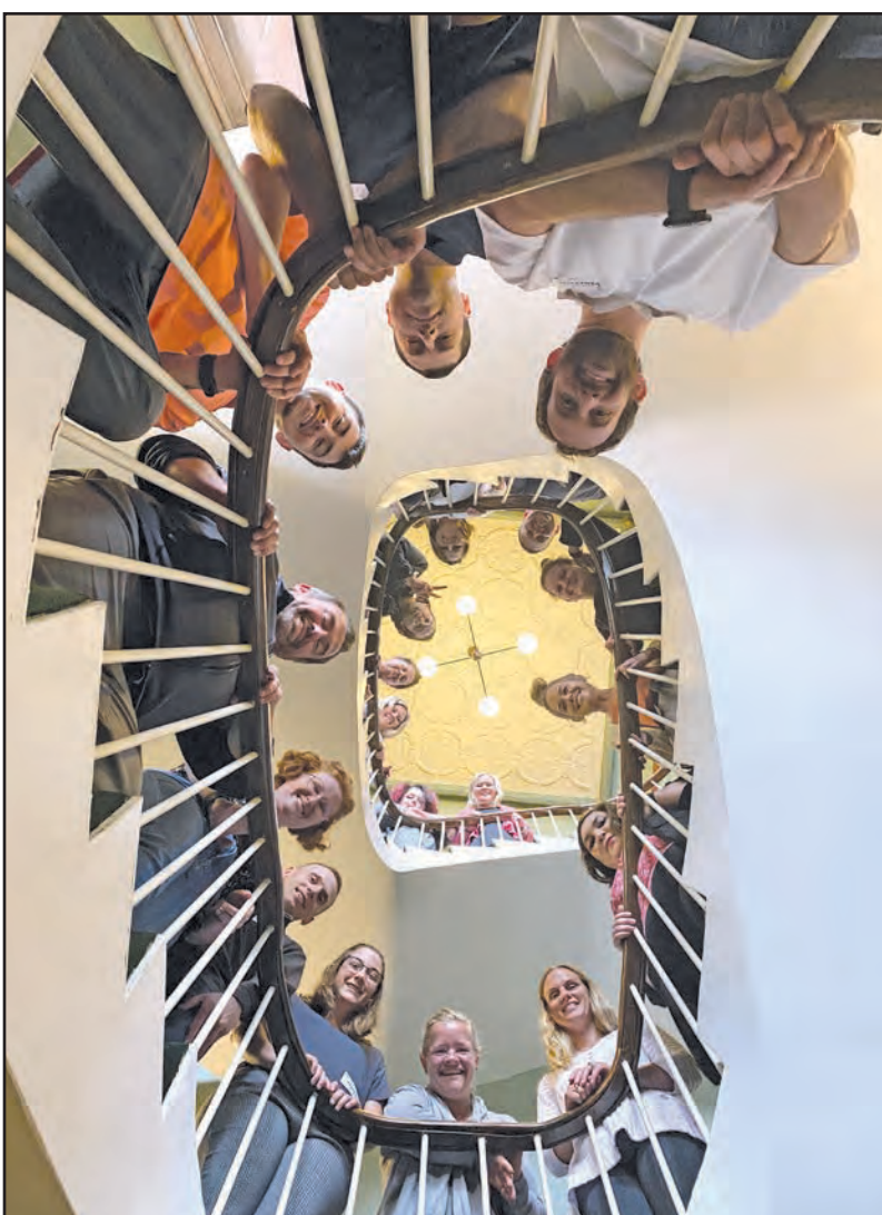
The class session focusing on the judicial system was so impactful, class members invited the Hon. Joseph McBride to speak at the class' graduation on November 10, 2022. (Submitted photo)