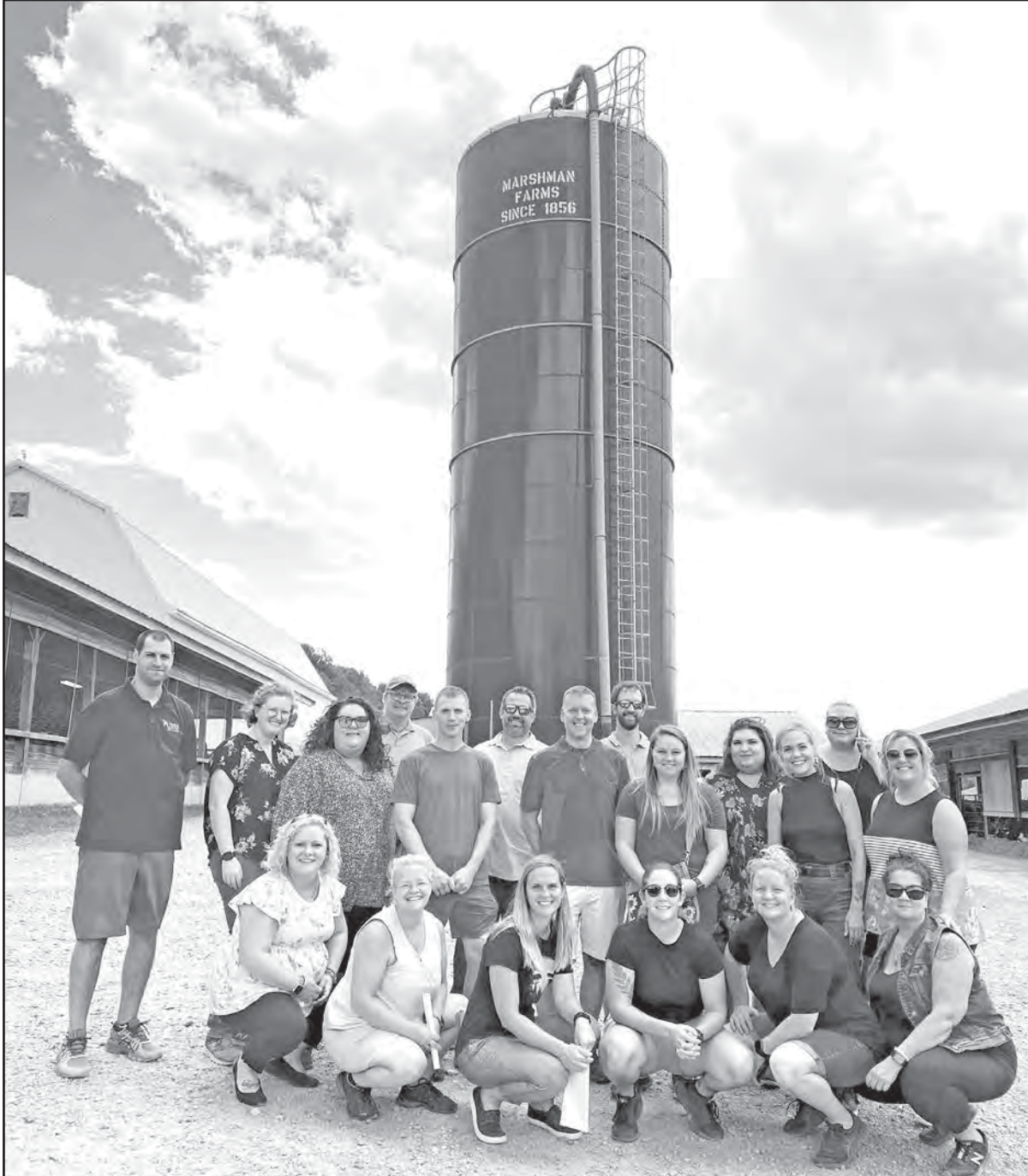
The Class of 2022 interviewed local agricultural producers, spent a day at the Chenango County Fair, and visited Marshman Farms in Oxford as part of their deep dive into Agribusiness.