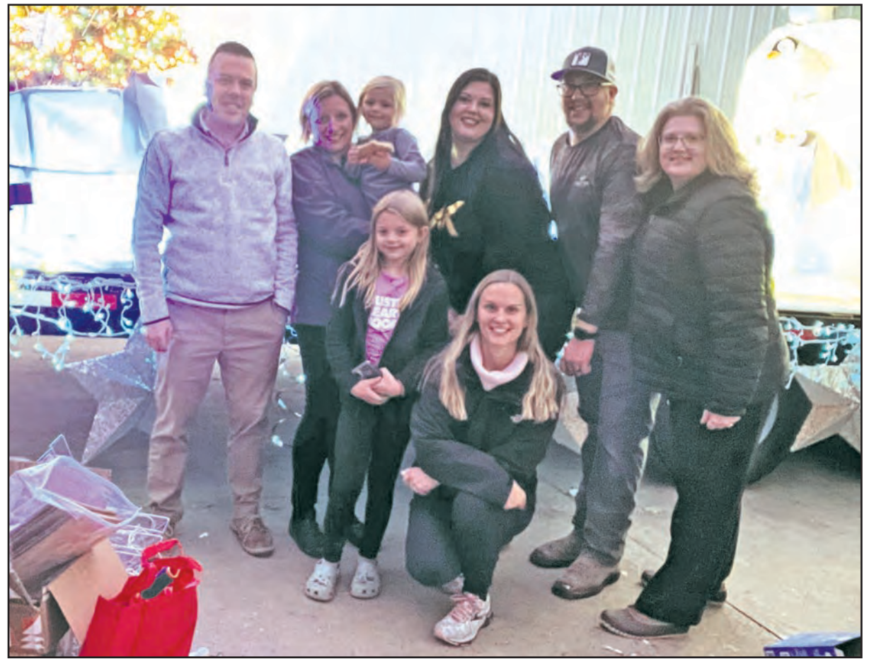
NBT Bank's 2023 Parade of Lights float volunteers take a break from construction to pose in front of their work.