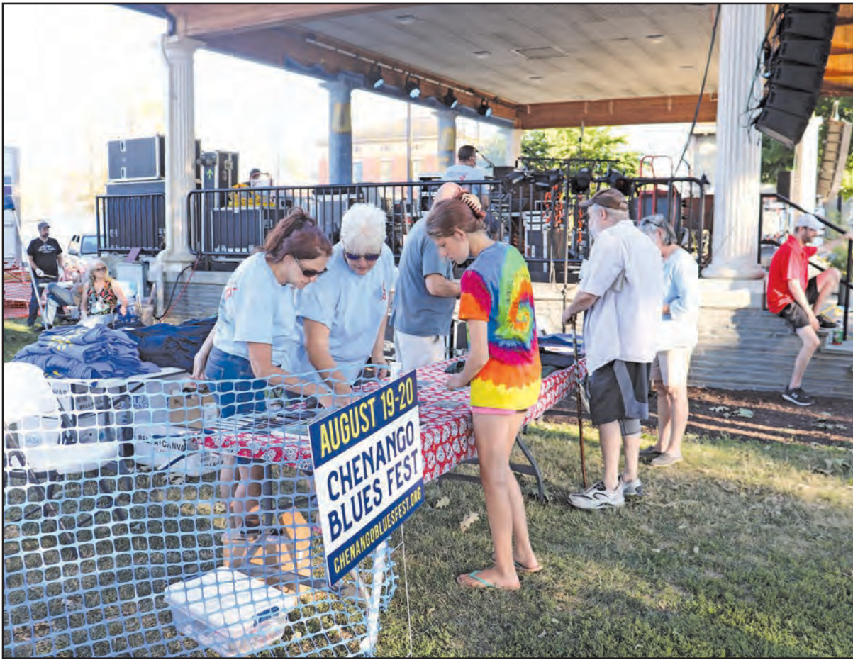
NBT Bank employees volunteer at the merchandise table at the NBT Bank Summer Concert Series.