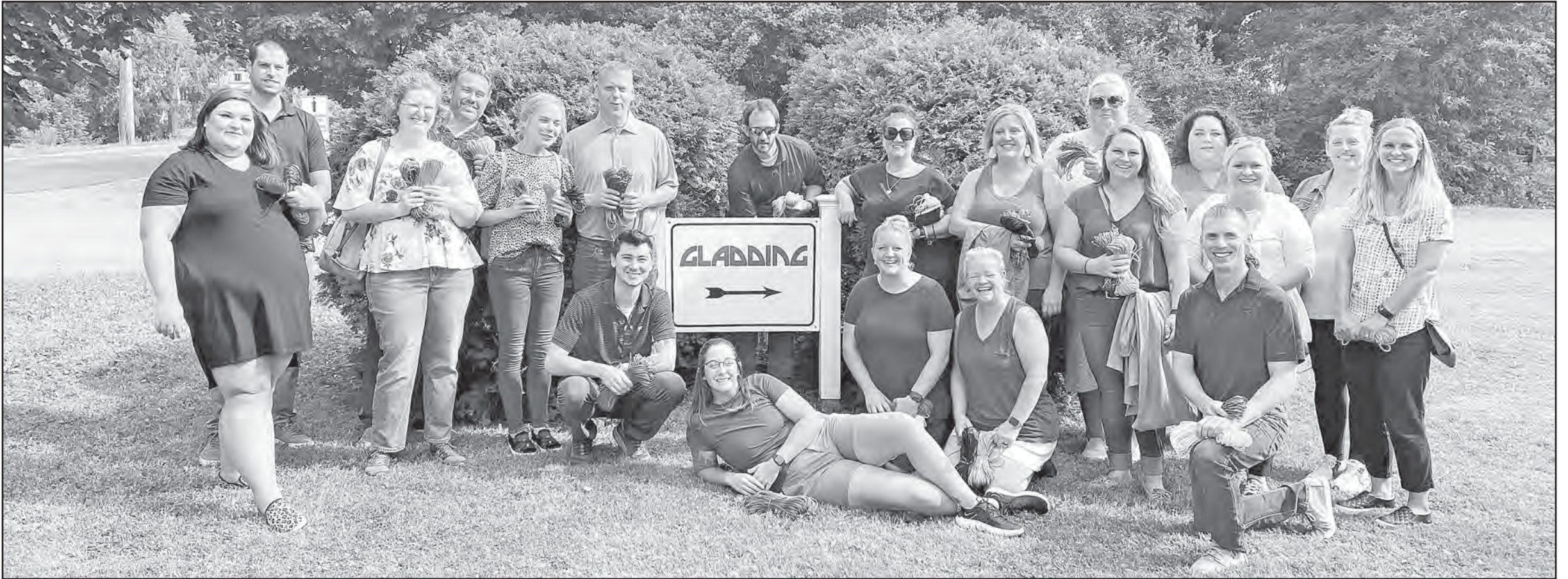
In July, the Leadership Chenango Class of 2023 visited Gladding Braided Products in South Otselic and Mid York Press in Sherburne, as well as Golden Artist Colors and Chobani in the Town of Columbus.