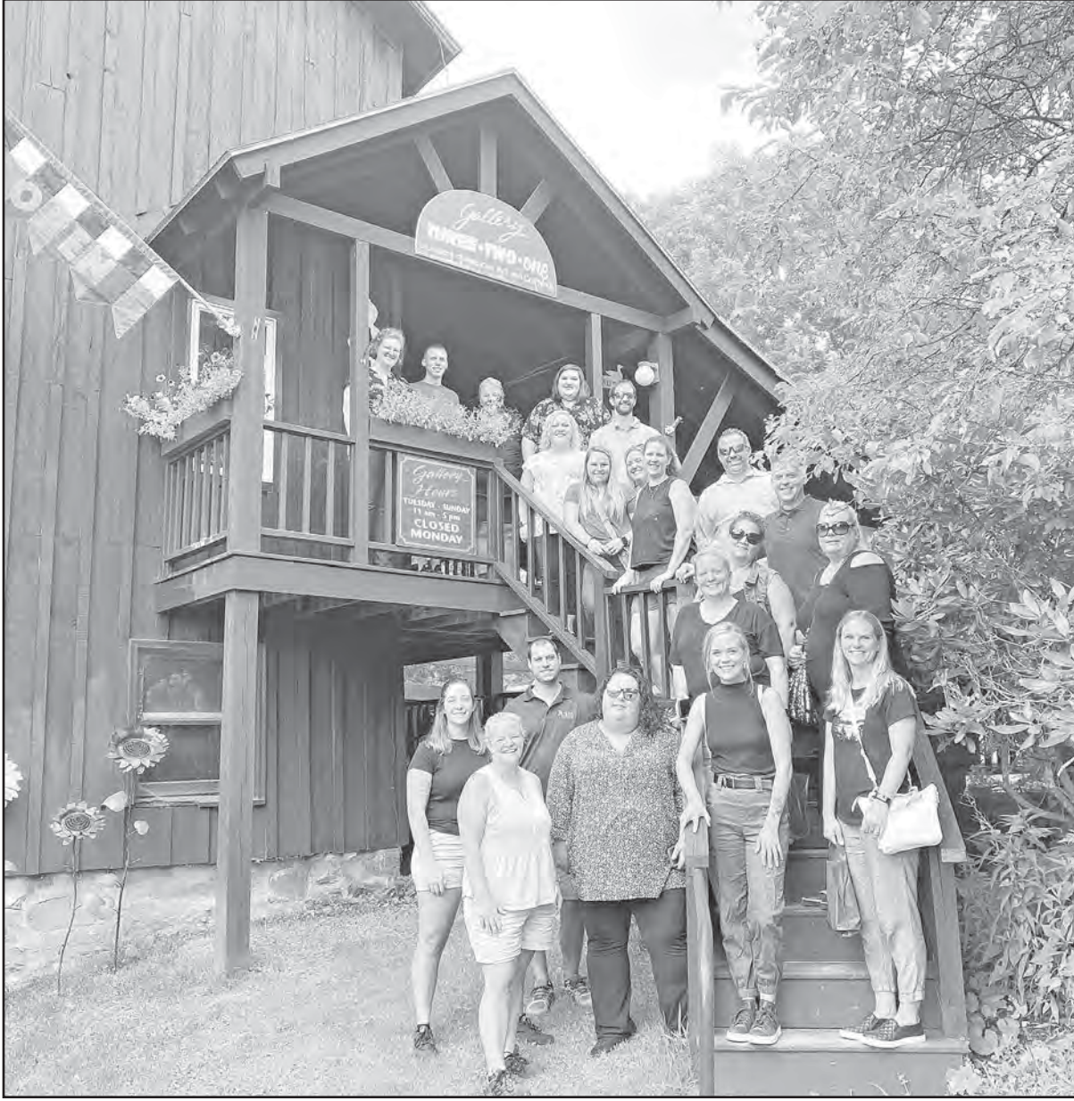
Members of the Leadership Chenango Class of 2022 were treated to a pottery throwing demonstration at Gallery 3-2-1 and Strong Stone Pottery in Oxford.

Continued from Page 62 → to inspire and empower the leaders of tomorrow, and now that it has served its purpose, we must go out and, well, lead. We are each a smaller part of a bigger picture, but we will always have started off from the